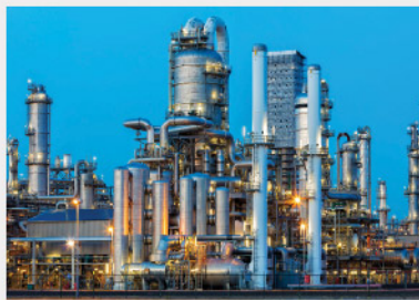
INDUSTRIAL TURNAROUND SERVICES