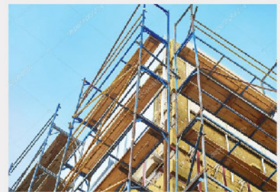
INSULATION & CLADDING